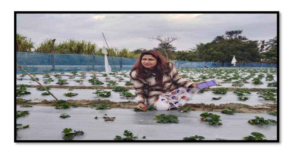
Fruits growing from healthy plants